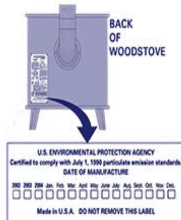
Permanent Wood Stove Label

Wood stoves offered for sale in the state of Washington must meet a particulate emissions limit of 4.5 grams per hour for non catalytic wood stoves and 2.5 grams per hour for catalytic wood stoves.