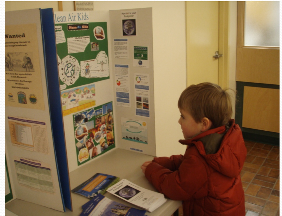
Display tables at Public Library and Recreation Centre